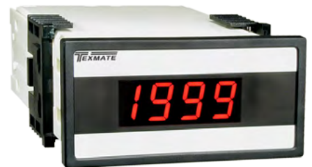
1/8 DIN 96x48 mm 3.78"x1.89"