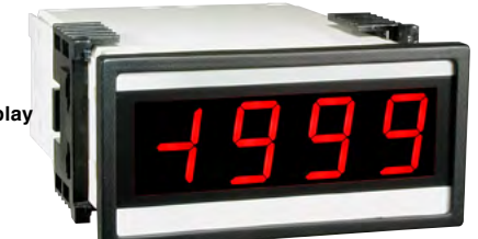
DX-35 with 0.8" display