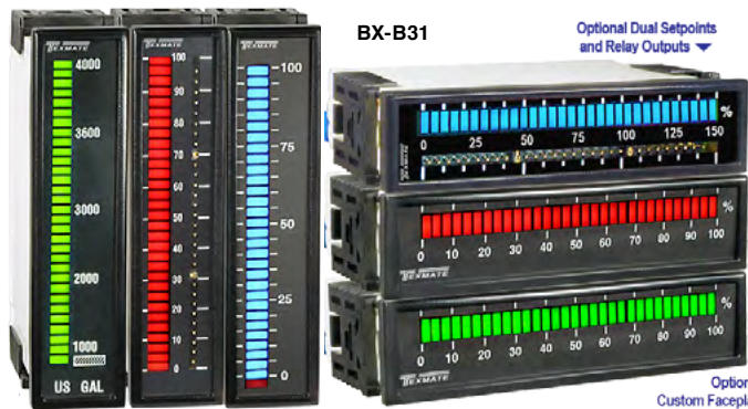
1/16 DIN 96x24 mm 3.78"x0.95"