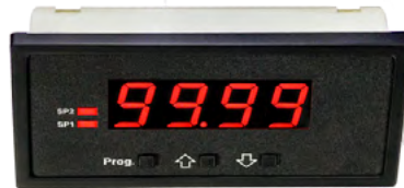
Optional Remote Display Programmer Needed for Programming Relays

PS1 85 to 265 VAC 3.5W 50-400 Hz 95 to 300 VDC 3.5W