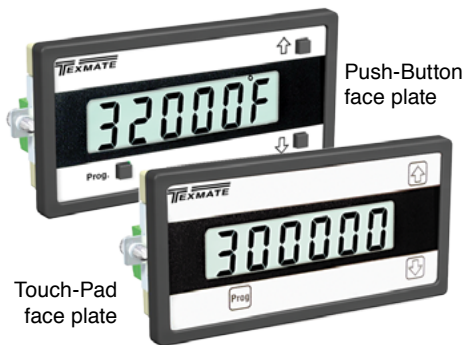
Push-Button face plate

▶ SD-50X.....4-20mA DC Current Loop (100.00). • The SD-50X features lockable front panel scaling and calibration. • Any 4 to 20 mA signal can be scaled from almost any two input values to display any required engineering unit of measure. • A 4-20 mA input can display 50,000 counts of resolution from -19,999 to +30,000. • The 6 th digit can be selected to display °F, °C or an inactive extra zero from a dip switch at the rear of the case. • With less than a 4 V loop drop, this meter can be inserted in the 24 V input loop excitation provided by our Lynx, Leopard and Tiger meter families. • The optional 4-20 mA outputs from these meters can power several SD-50X units as remote displays. • Two SD-50X meters can be mounted in a 96x96 DIN cutout and powered from the same loop, but display different scale readings such as °F and °C, lbs and kg or psi and Torr. • Easy scaling and high resolution also enables the SD-50X to be used as a precision counting scale, for nuts and bolts, barrels or boxes.