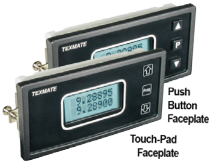
Push-Button face plate