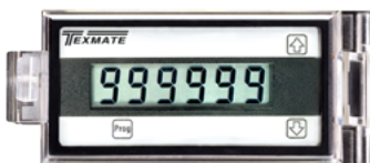
Optional NEMA-4X Clear Lockable Water & Dust Proof cover P/N: OP-N4X/96X48

• For ordering info call: 1-800-TEXMATE or 760 598-9899 • Email: orders@texmate.com • 24 Hours • For tech assistance call: (760) 598-9899 450 State Place, Escondido, CA 92029