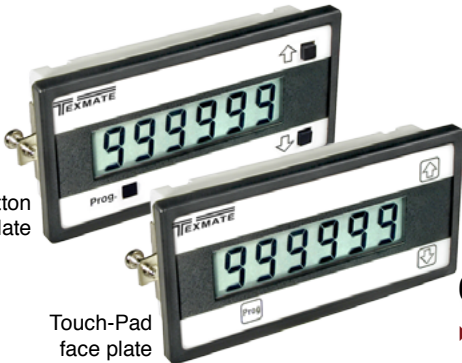
Touch-Pad face plate

▶ SD-60XI .....4-20mA DC Current Loop (100.000).